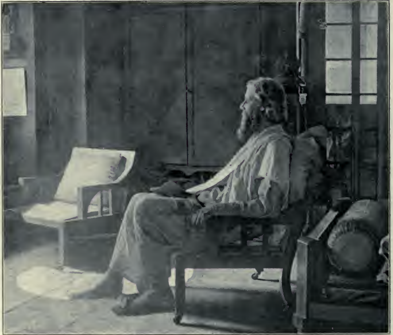
AT SHANTI NIKETAN.