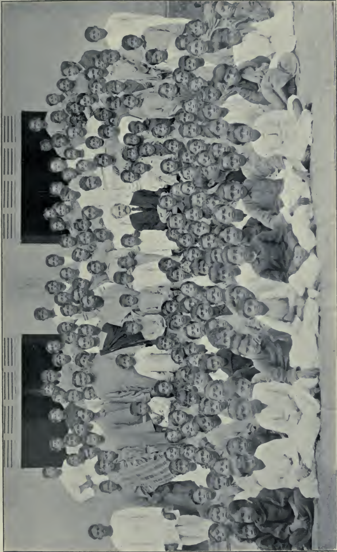
SHANTI NIKETAN—THE SCHOOL.